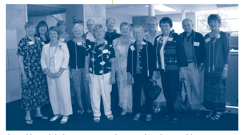
Alumni celebrate with the dean (center) at a special reception to honor their accomplishments.

"It was an honor to represent the Alumni at the graduation ceremony in June. How wonderful to see all those bright,