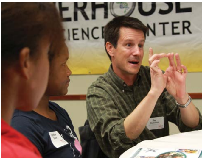
A scientist talks with students about his research