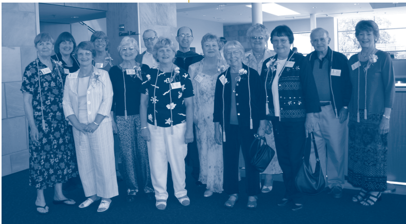
Alumni celebrate with the dean (center) at a special reception to honor their accomplishments.