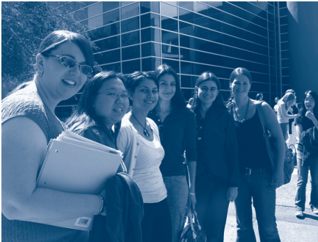
First year teachers return to School to complete Master's degree.

After completing their Credential in the School last spring and embarking on their first year of teaching, 98 teachers returned this fall to complete their MA, which will culminate in research on a problem they identify in their own classrooms.