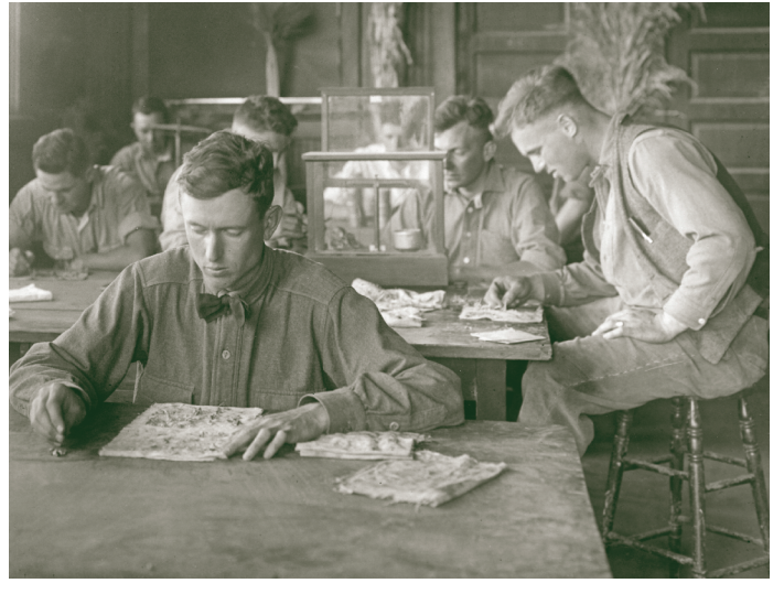
For 100 years, UC Davis has prepared and inspired students and developed solutions to some of society's most pressing problems. As we look to the future, we will continue to address issues that matter most to California and the world.

In fact, UC Davis has been training teachers (beginning with agriculture education specialists) for more than 90 years. We are proud to build on this tradition and extend the campus's reach into the lives of schools, teachers and students throughout our state and beyond.