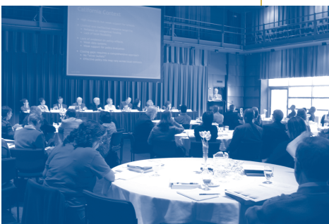
Researchers gathered at UC Davis to present ten policy briefs.