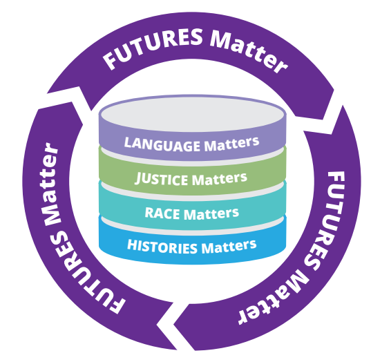
FIGURE 3: MAISHA T. WINN, 2019

As transformative evaluators, we expect our social justice values to influence the process and outcomes of our evaluation work.<sup>13</sup>