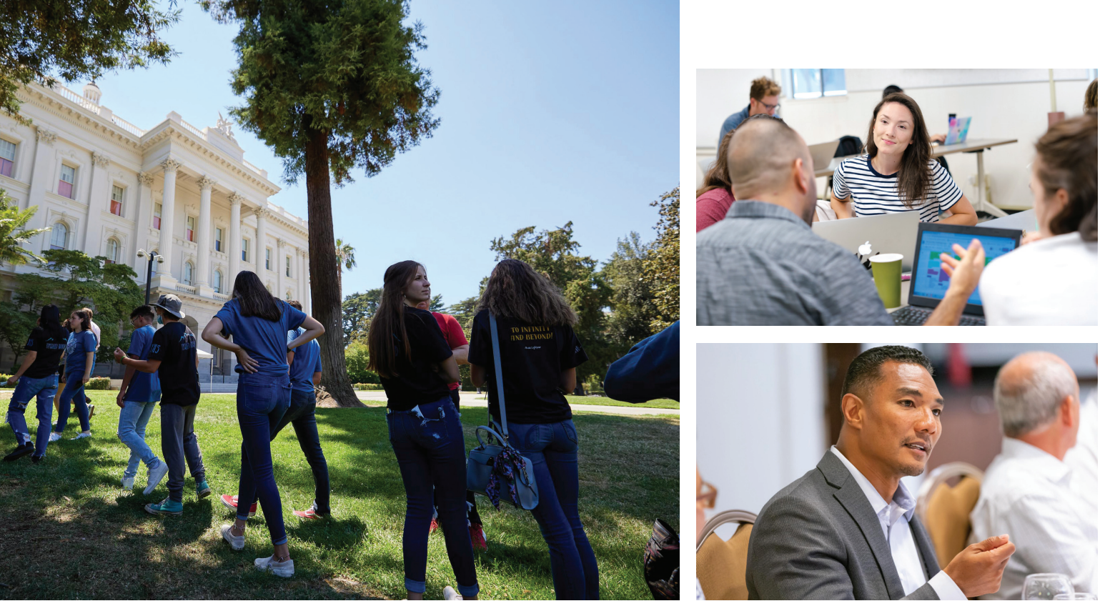
(Clockwise from left) High school students in REEd's Upward Bound program visit the Capitol; teachers and graduate students meet during the Center for Shakespeare in Diverse Classroom's Summer Institute; community college leaders convene for a Wheelhouse Institute.